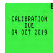
Configurable calibration options