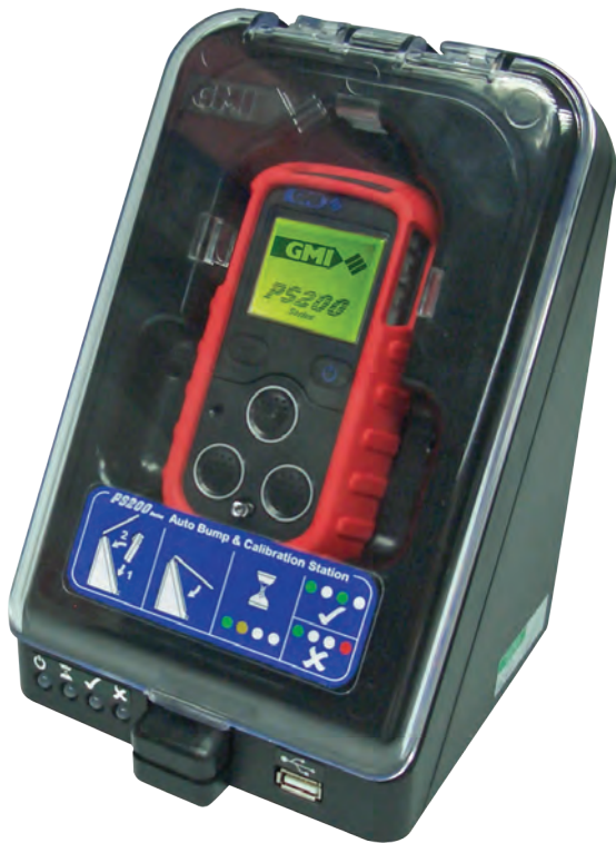
Coloured 'rubber boot' for multi-site or multi-application working (7 colours available)

To complement the Personal Surveyor product line, Teledyne has developed a compact, robust and easy to use Auto Bump & Calibration Station that can provide full bump and calibration options. Data transfer is facilitated using a USB memory stick with Standalone software that is simple to set up and customise based on end users' specifications. Standalone, PC, and ethernet versions are available.