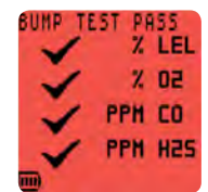
Configurable bump options