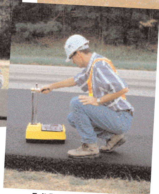
Full Depth Asphalt or Concrete