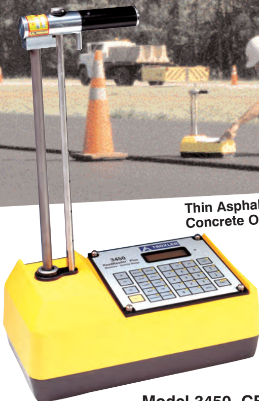
Model 3450 CE