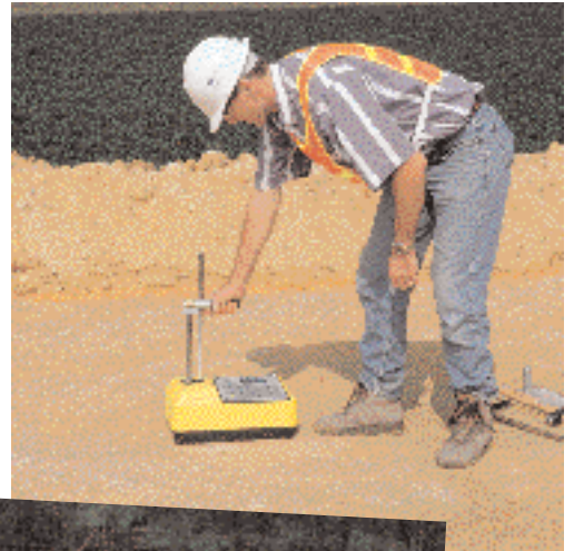
Soil and Aggregates