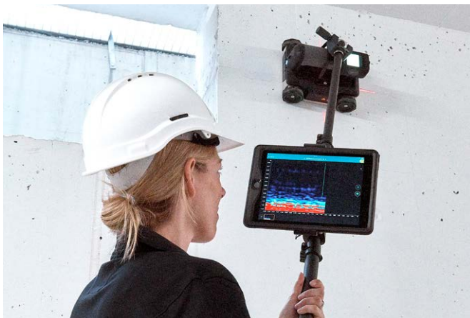
Proceq GPR Live combined with the telescopic rod with tablet holder

Proceq GPR Live is the beginning of a new era in NDT. The outstanding and unique ultra-wideband technology in structural building assessment combined with a compact wireless scan car delivers unmatched performance. The new Proceq GPR Live comes with the unique stepped-frequency continuous-wave (SFCW) technology delivering the widest frequency spectrum in the concrete assessment market. All applications typically addressed with multiple separate antennas in the range of 0.9 to 3.5 GHz can now be covered with a single device!