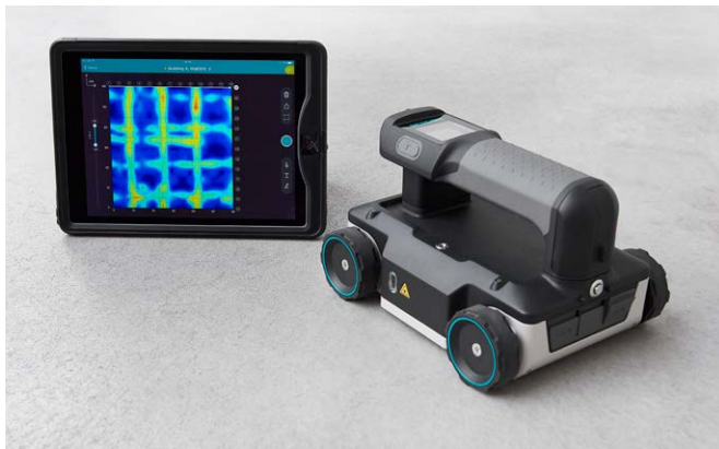
Proceq GPR Live scan car wirelessly connected to an iPad