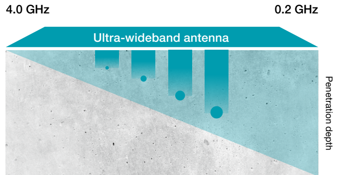
Proceq GPR Live covers all frequencies from 0.2 to 4.0 GHz with one single device. Lower frequencies allow deep penetration depths while higher frequencies allow for the detection of small objects.