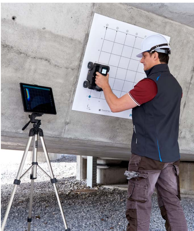
Proceq GPR Live performing an area scan with the aid of a Proceq grid paper