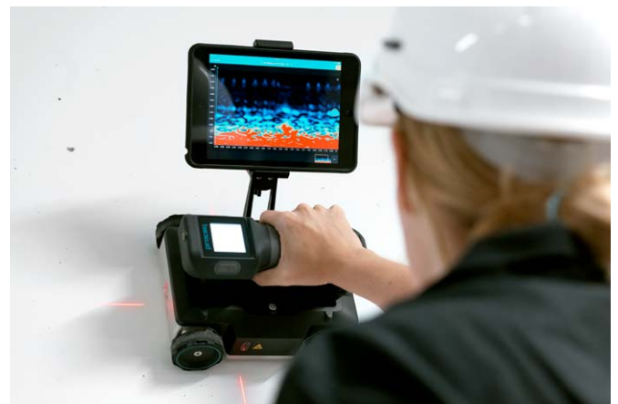
Proceq GPR Live combined with the device tablet holder

Proceq GPR Live is a groundbreaking product that offers a wide selection of accessories to fit every user's needs, such as the on-device tablet holder for single-hand operation and the telescopic rod for accessing hard-to-reach areas. Unlike other GPR products, its flexible set-up allows the user to always have a large screen at an optimal viewing position with all controls within easy reach.