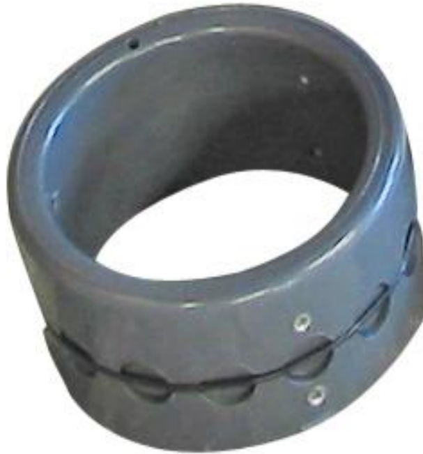
FIGURE 1-1 COMPONENTS OF A TARGET MAGNET

The target magnets (Figure 1-1) are pre-installed to the corrugated pipe at specific intervals. However, they can be adjusted to customer intervals in the field. Simply loosen the set screws on the target magnets, move the magnets to the desired location, and tighten the set screws. The deepest target magnetic ring should be at least 300mm (12 inches) from the bottom of the corrugated pipe to allow the reed switch probe to pass the magnetic field.