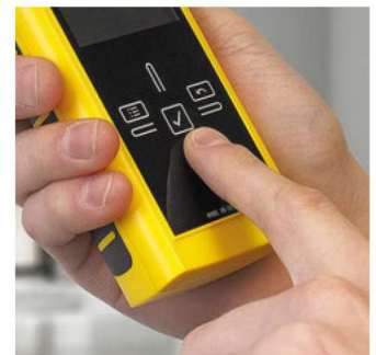
T610 and T660 come with a continuous surface made of highly scratch-resistant Blanview special glass and capacitive touchscreen control panel.

During measuring, the user can focus exclusively on the measuring object without the need to permanently keep an eye on the displayed measuring results.